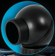
BALL SWIVEL JOINT ADAPTOR