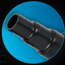
STEPPED HOSE TAIL