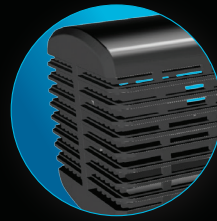
ADDITIONAL CAGE FILTER COVER (SELECT MODELS)